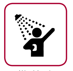
Washing/ taking a shower